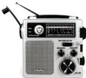
AM/FM radio with NOAA Weather, TV, VHF, flashlight and cell phone charger