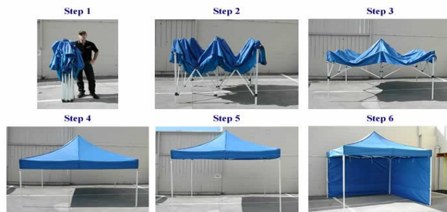
Example of easy up canopy